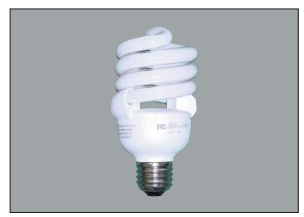
Dedicated fluorescent lamp